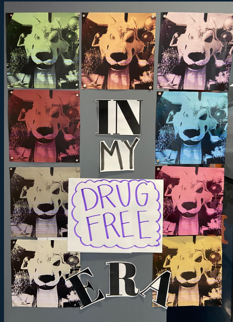
2nd Place: Hogelucht