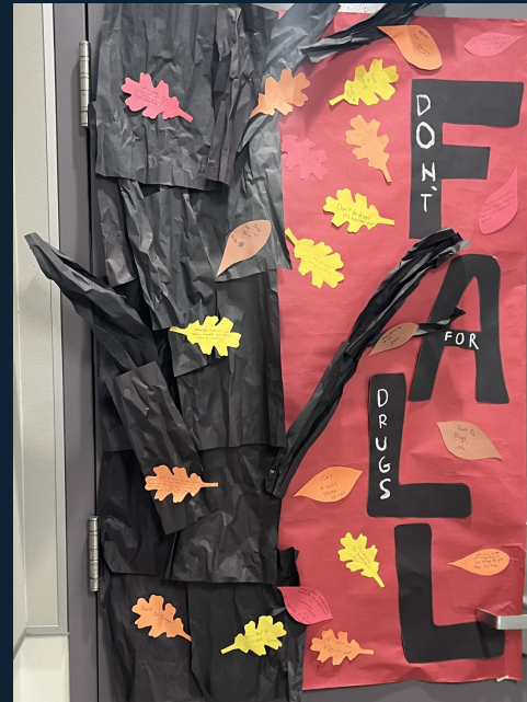
3rd Place: Chen